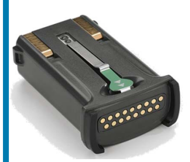
BTRY-MC9X-26MA-01 MC9090, MC9190, MC9200 PowerPrecision Spare Lithium Ion battery, 2600 mAh

Pack of 10 spare batteries is also available: