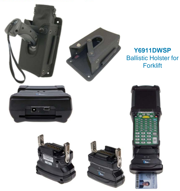
1139-01-SO-MC9X00-CAC TSL Common Access Card reader for MC9100