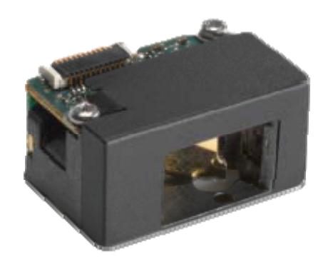
MC9190-GA 1D Standard Range Laser